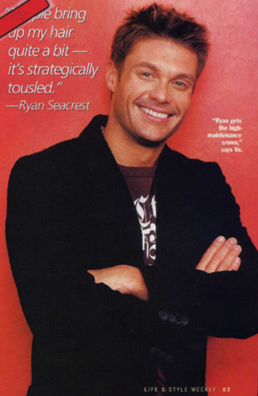
"Ryan gets the high-maintenance crown," says Vo.

"People bring up my hair quite a bit — it's strategically tousled." —Ryan Seacrest